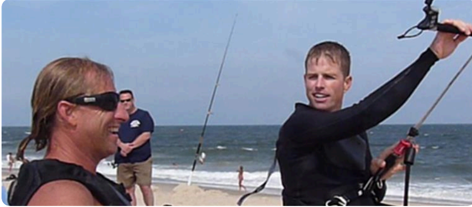
Loop: "crap wind today" Bryan: "yup"

Watson Funeral Home & Crematorium shared a photo to the Rory album. February 14 at 3:00 PM